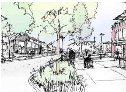
The updated plan allows for taller townhouses and commercial buildings.